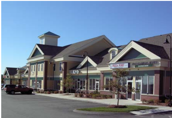
Devens Commons retail stores

Devens is now home to more than 80 businesses employing over 4,000 workers. Despite the 4,100 military jobs and 2,900 civilian jobs that were lost due to the base closure, unemployment rates for the four host towns have rebounded impressively. Estimated wages for Devens totaled nearly $130 million in 2005.