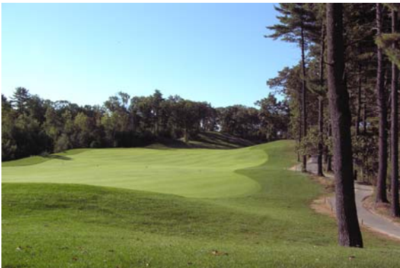
Red Tail Golf Club

The highly acclaimed Red Tail Golf Club – named for the red-tailed hawks that often soar overhead -- was established in the southeast corner of Devens in 2002. This 18-hole championship golf course was honored as the first Audubon International Signature Sanctuary golf course in New England for its environmentally-sustainable design and management practices.