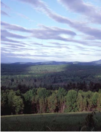
View overlooking the Oxbow National Wildlife Refuge